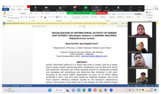
Figure 1. Sosialization by zoom application

It is expected that seminar participants will give questions if there is seminar material that is not understood, so that discussions are held to solve the problem.